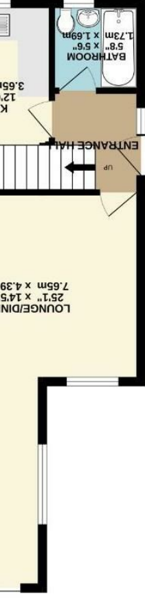
GROUND FLOOR (42.0 sq.m.) approx.